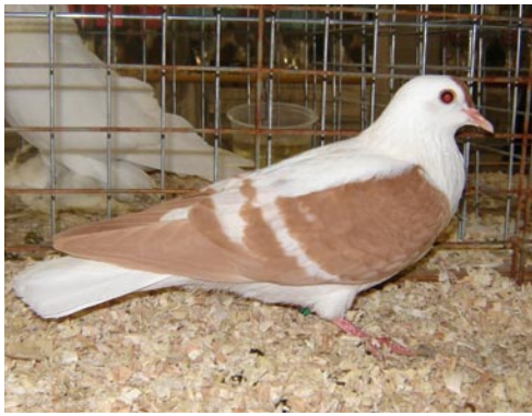
Perry Mueller; S4 Yellow WB CL