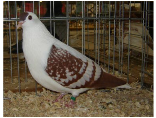
Perry Mueller; S3 Red Spangle CL