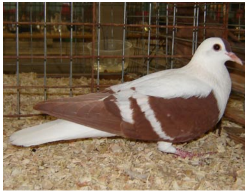
Perry Mueller; S2 Red WB CL