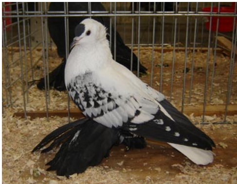
Perry Mueller; S2 Black Spangle