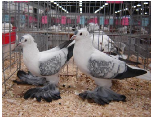
Sale birds; Blue Spangle Fairies