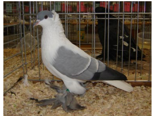
Perry Mueller; S Blue WB Fullhead