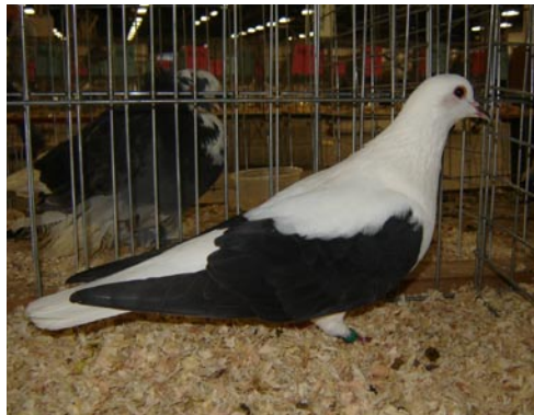
Dennis Streeter; S2 black barless CL