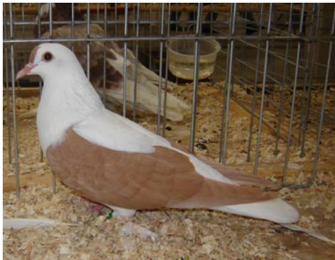
Gerald Kress; S1 yellow barless CL